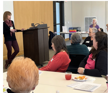
New Member Happy Hour Photos

Who's New in Madison ... where new faces become old friends