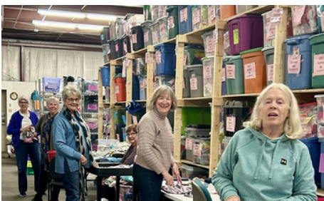
Babies & Beyond Volunteers