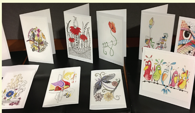
Sally Falk discovered drawing in a Zentangle class in Mineral Point a few years ago and displayed a series of individually-drawn writing cards.