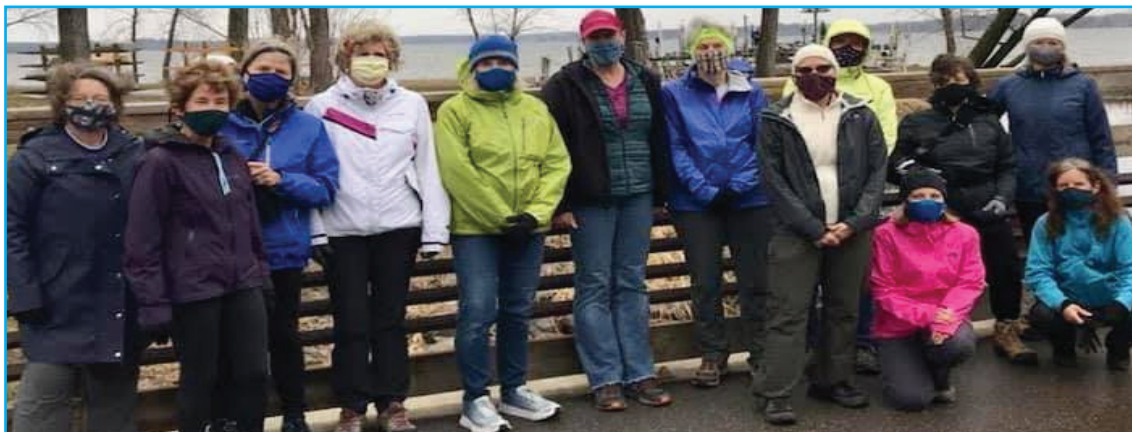
Wednesday Hiking Interest Group