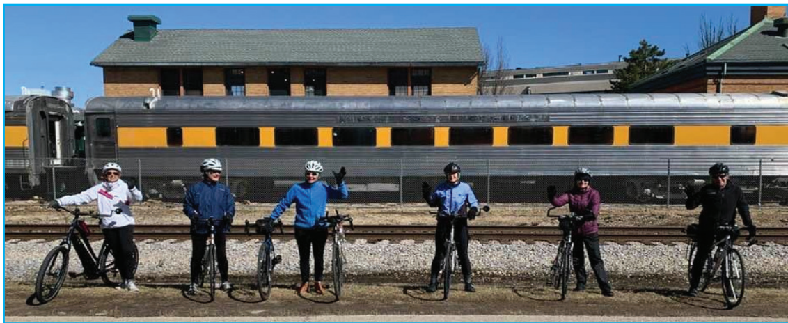
Friday Biking Interest Group

A gentle reminder that WNIM's success starts with you. Those of you have been in WNIM for many years and those who have only recently joined have much to share. We depend 100% on our member volunteers to run the organization. Volunteers are the lifeblood of our group. We hope you will be there in some capacity to help this extraordinary group of women to continue to thrive in our community with our social activities, luncheons, interest groups and/or on our Board. Please consider volunteering when an opportunity comes up. ■