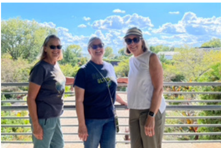
Wednesday Walkers at Olbrich