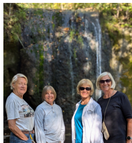
Ramblers at Stephens Falls