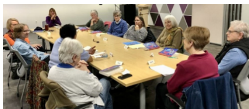
Nonfiction Book Group