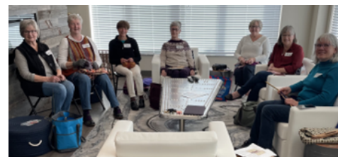
Ladies Who Knit