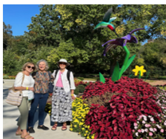
Ladies of the Garden