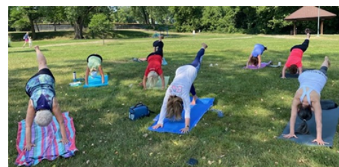
Yoga in the Park

Who's New in Madison ... where new faces become old friends