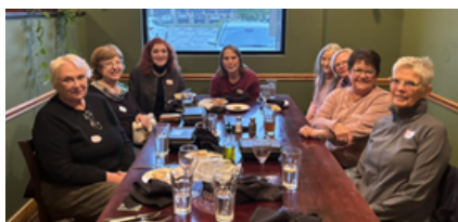
Friday Film Group