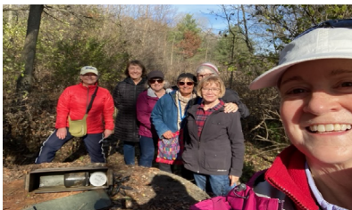
Geocaching in Elver Park