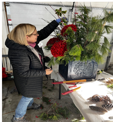
Ladies of the Garden Wreaths