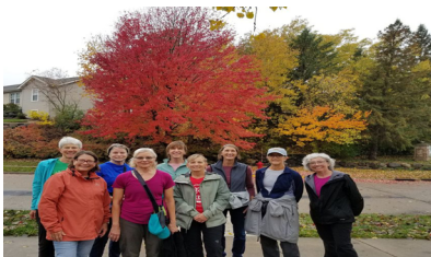
Enjoying the Fall Colors