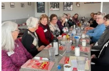
Eastside Coffee Bunch