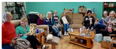
Hook, Needle & Stitch